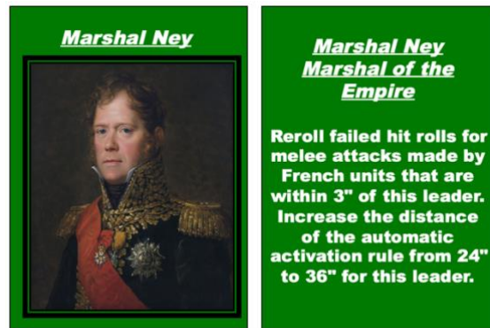
Leader Card Back

The leader cards are included for use when you include a leader in an army. Print, cut out and mount the leader cards as described above, and then give the card to the player commanding them as a reminder of the leader's special abilities.