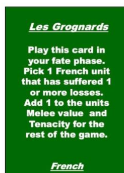
French Card Front (14)