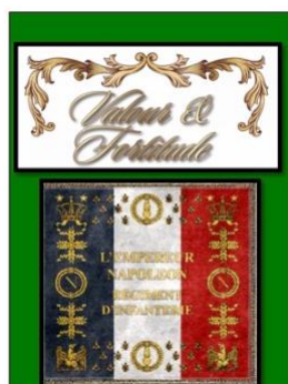
French Card Back (15)

Carefully cut out all the cards that you have printed out. After doing so, you will have 15 card backs showing a flag of the nation the fate cards are for, and 14 card fronts with the text from the fate table of the nation's army sheet.